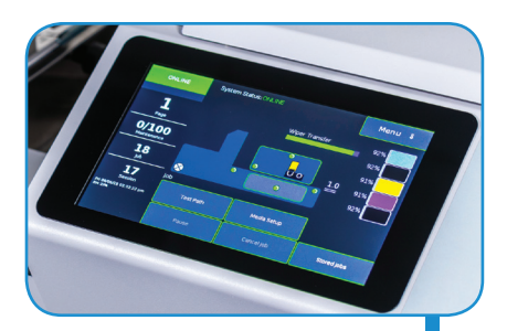
Intuitive 7" color touchscreen displays system status, image preview, and provides access to stored jobs