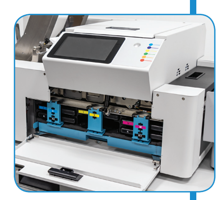
Clamshell design offers easy front access to ink tanks and paper path