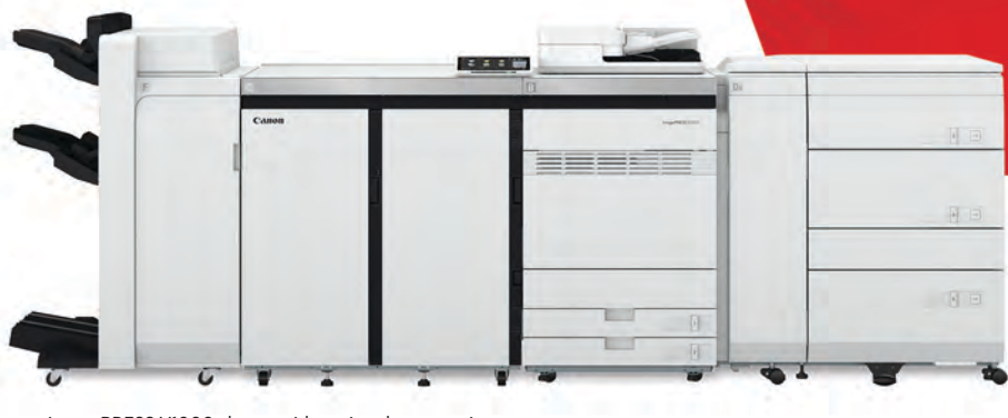
imagePRESS V1000 shown with optional accessories.

Superb Registration Accuracy and Consistency